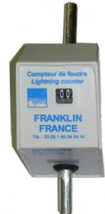
Lightning counter AFV0907CF