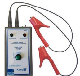
Wired tester AFV0050TT

This tester power supply operates with a battery (provided). The display with indicator lights indicates instantly the obtained result (positive or negative).